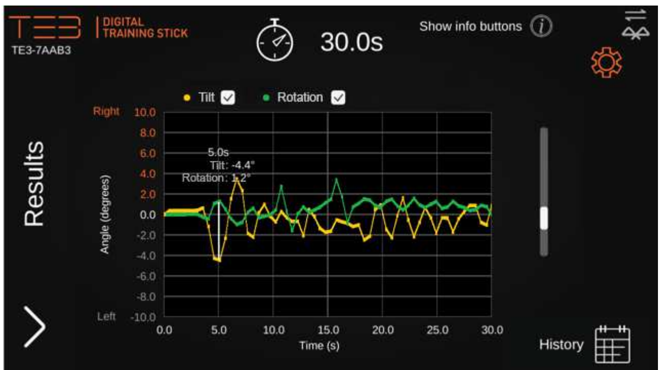
a screenshots of the TE3 PRO application

TE3 PRO unique high-end technology gives instant feedback by a vibrating impulse (tactile stimulus). The users can then correct and focus on the movements. 3D-sensors measure and analyze movements during every exercises. The mobile application then indicates visually, in real time, the results of the movements and provides a comprehensive analysis.